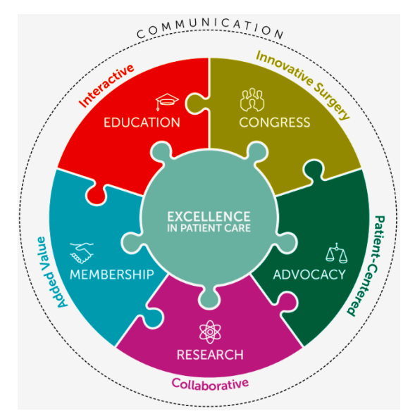
ESSO's Core Values

BRESO is the Breast Surgical Oncology Project initiated by ESSO and founded together as a joint platform between several key European organizations working on education, training and certification in breast cancer surgery.